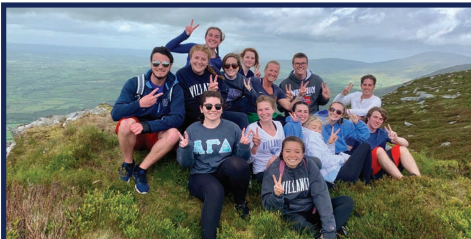
Villanova students participate in study abroad program.

With gratitude to The Friendly Sons of St. Patrick for their generous support of Villanova students.